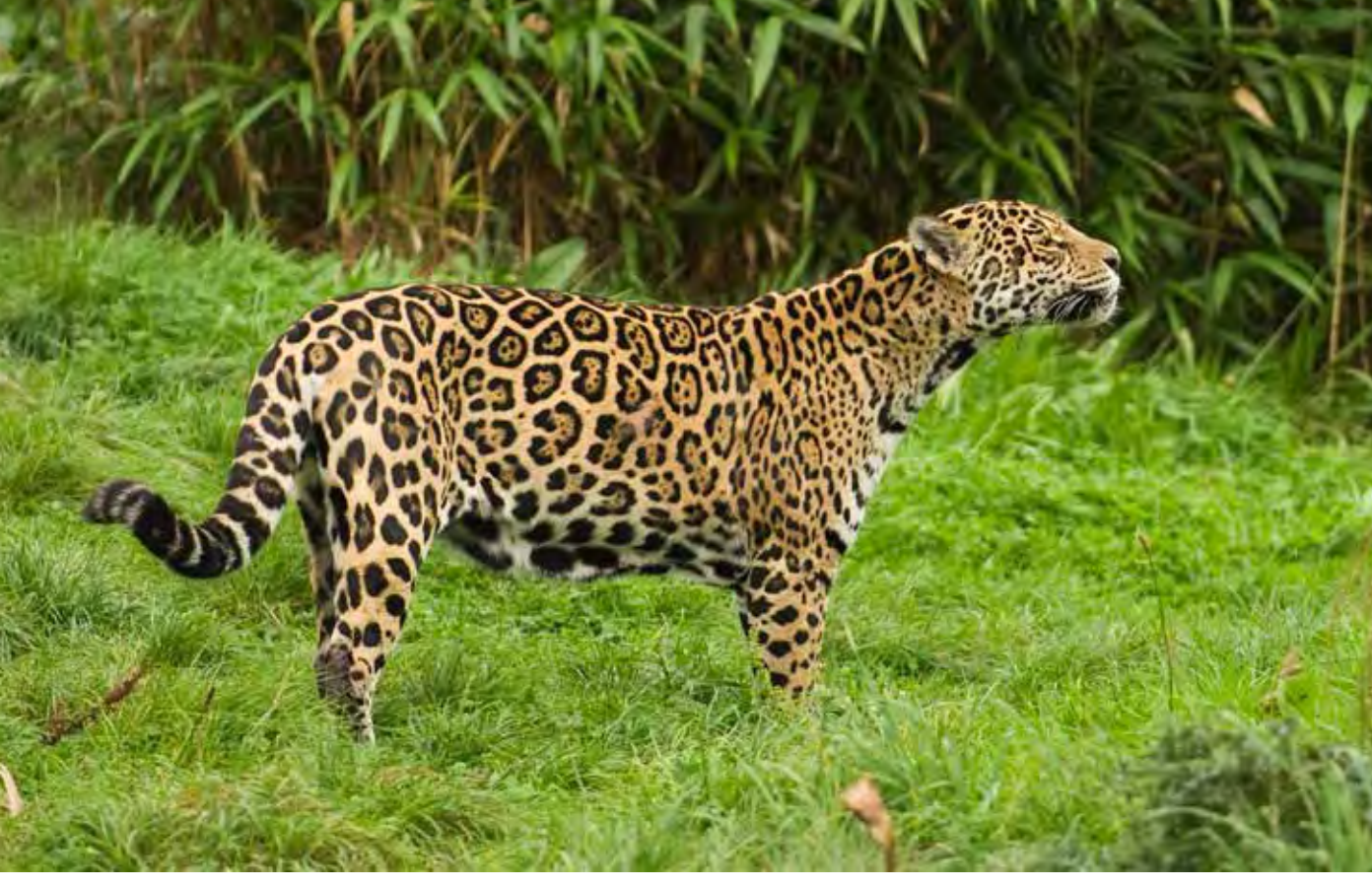
Since the early 1970s, the jaguar has been on the list of totally protected species in most South American countries. Though the threat from the commercial skin trade has abated, the jaguar is still losing ground to habitat destruction, and many are shot as cattle killers every year.

weight. However, today these powerful cats live in a landscape that lacks the large animals they are equipped to kill. Despite their robust physique and heavy-duty weaponry, modern jaguars manage to survive on a diet of surprisingly small animals such as armadillos, rodents, birds, and marsupials. Natural prey for today's jaguar is limited to peccaries, brocket deer, pampas deer, caimans, and capybaras, all of which generally weigh less than 110 pounds (50 kg). Really large natural prey like the occasional tapir and marsh deer are few and far between, so small prey is often the only thing on the menu.