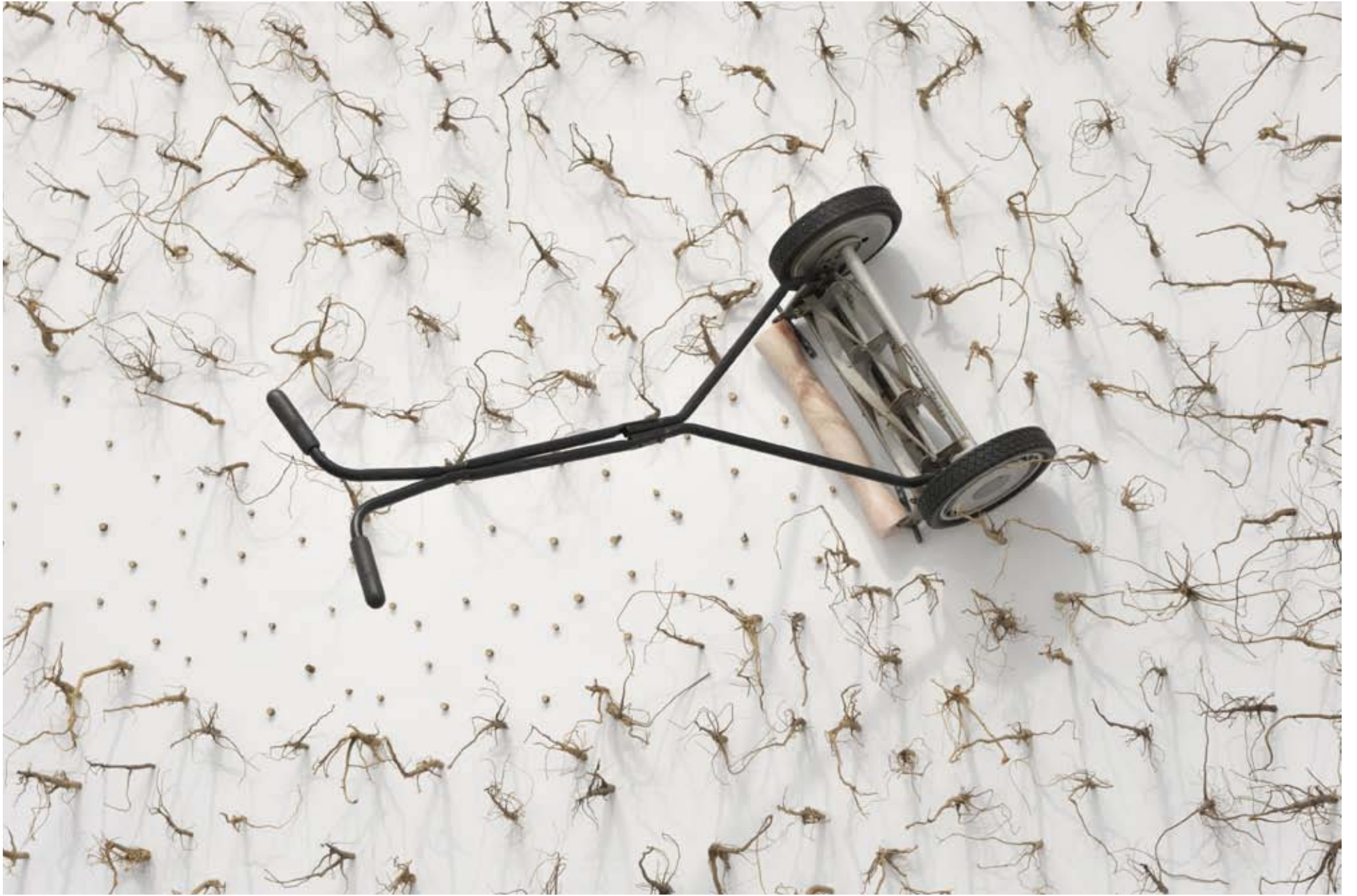
Greely Myatt, Cleave , 2008