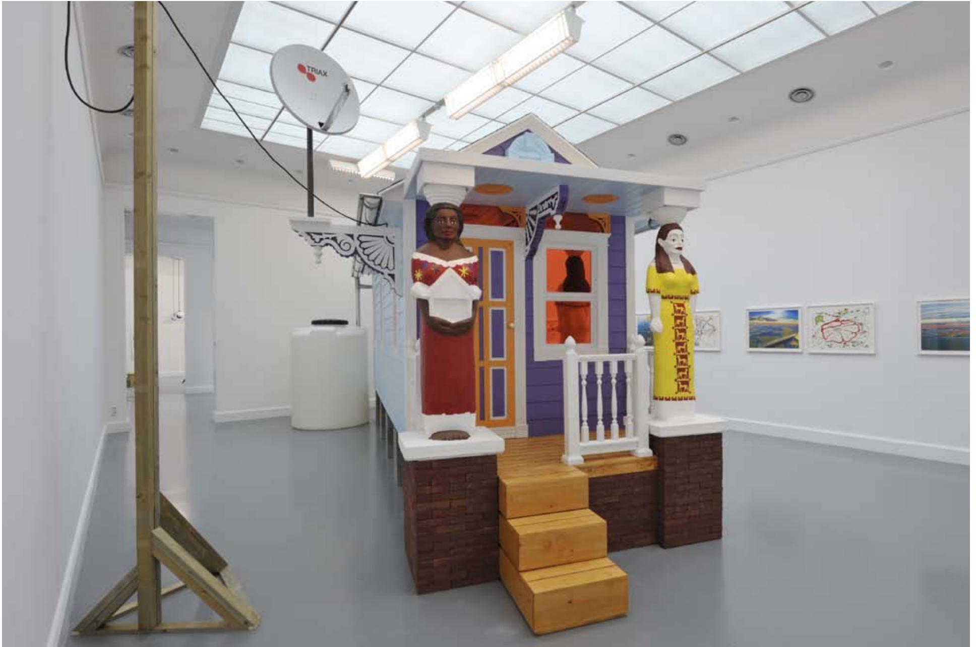
Marjetica Portč, New Orleans: Shotgun House with Rainwater-Harvesting Tank , 2008