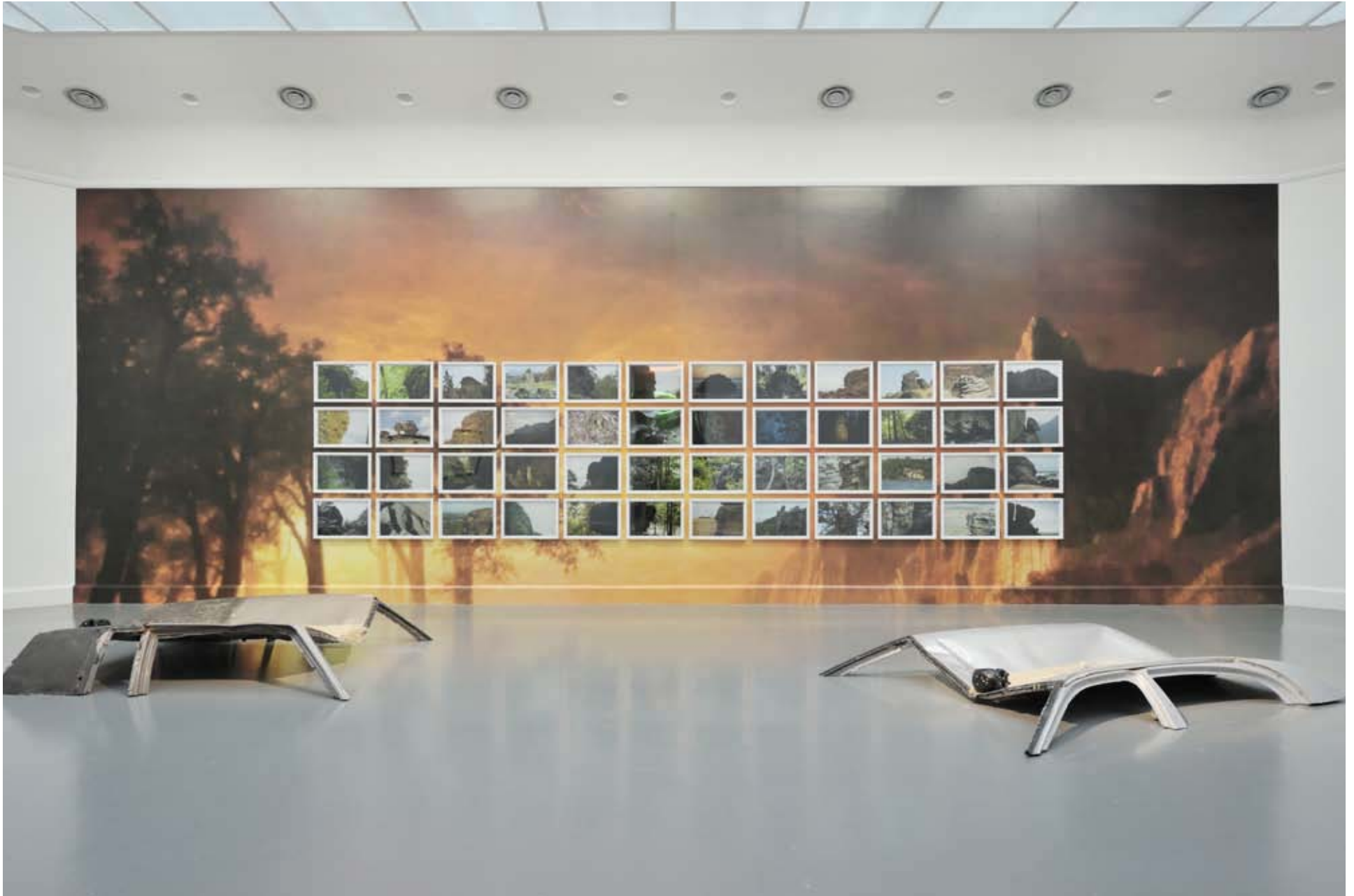
Matthew Day Jackson, Installation view of The Lower 48 , 2006