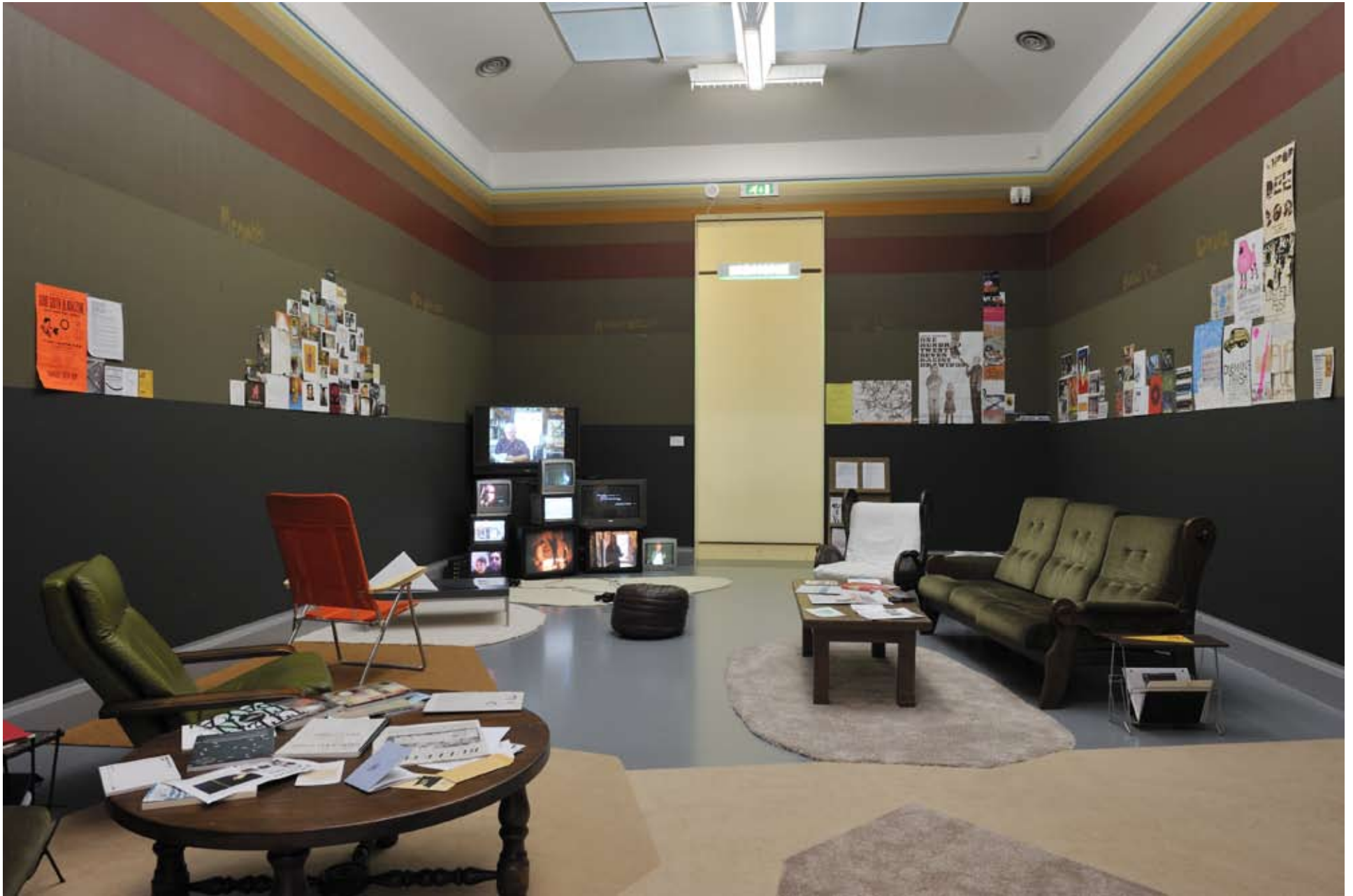
Design 99, Installation view of Homegrown , 2008