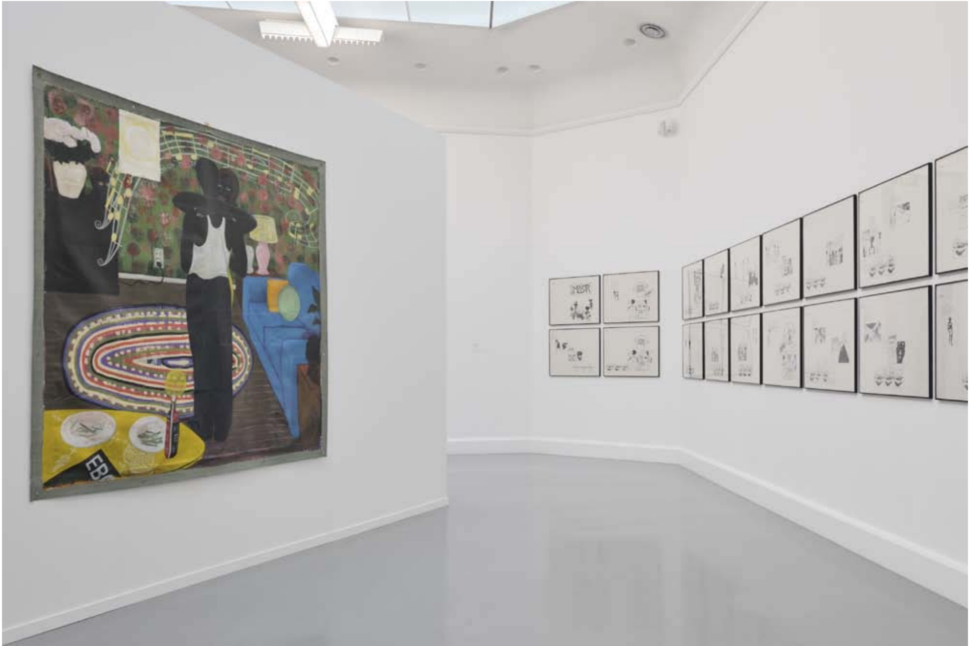
Kerry James Marshall, Installation view of Slow Dance , 1992–1993, and Dailies , 2006–2008