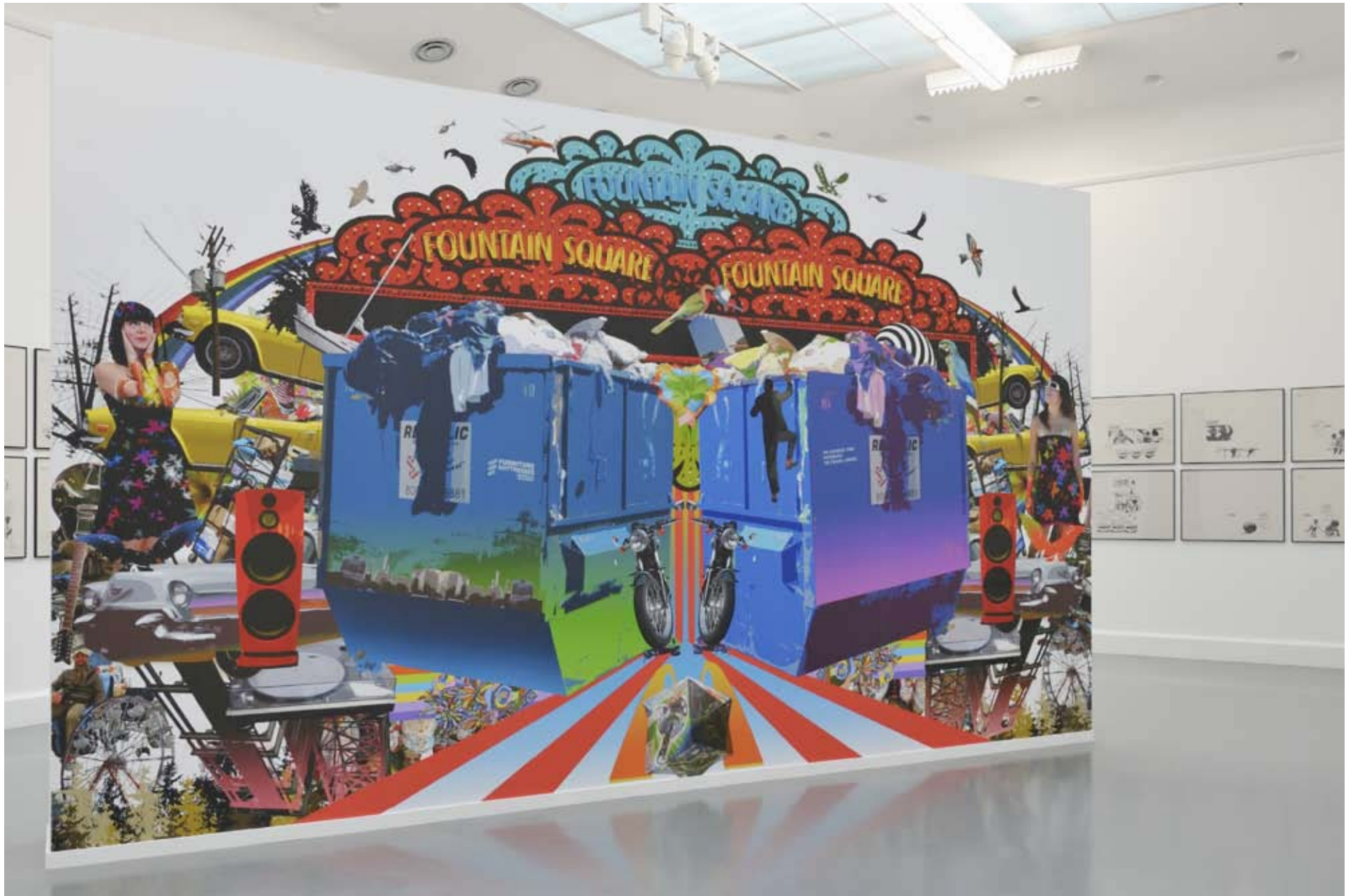
Artur Silva, Installation view of The Wealth of Regions , 2008