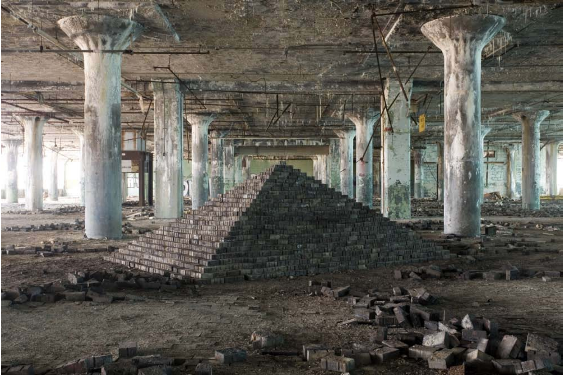
Scott Hocking, Ziggurat East/Fisher Body , Detroit, 2008