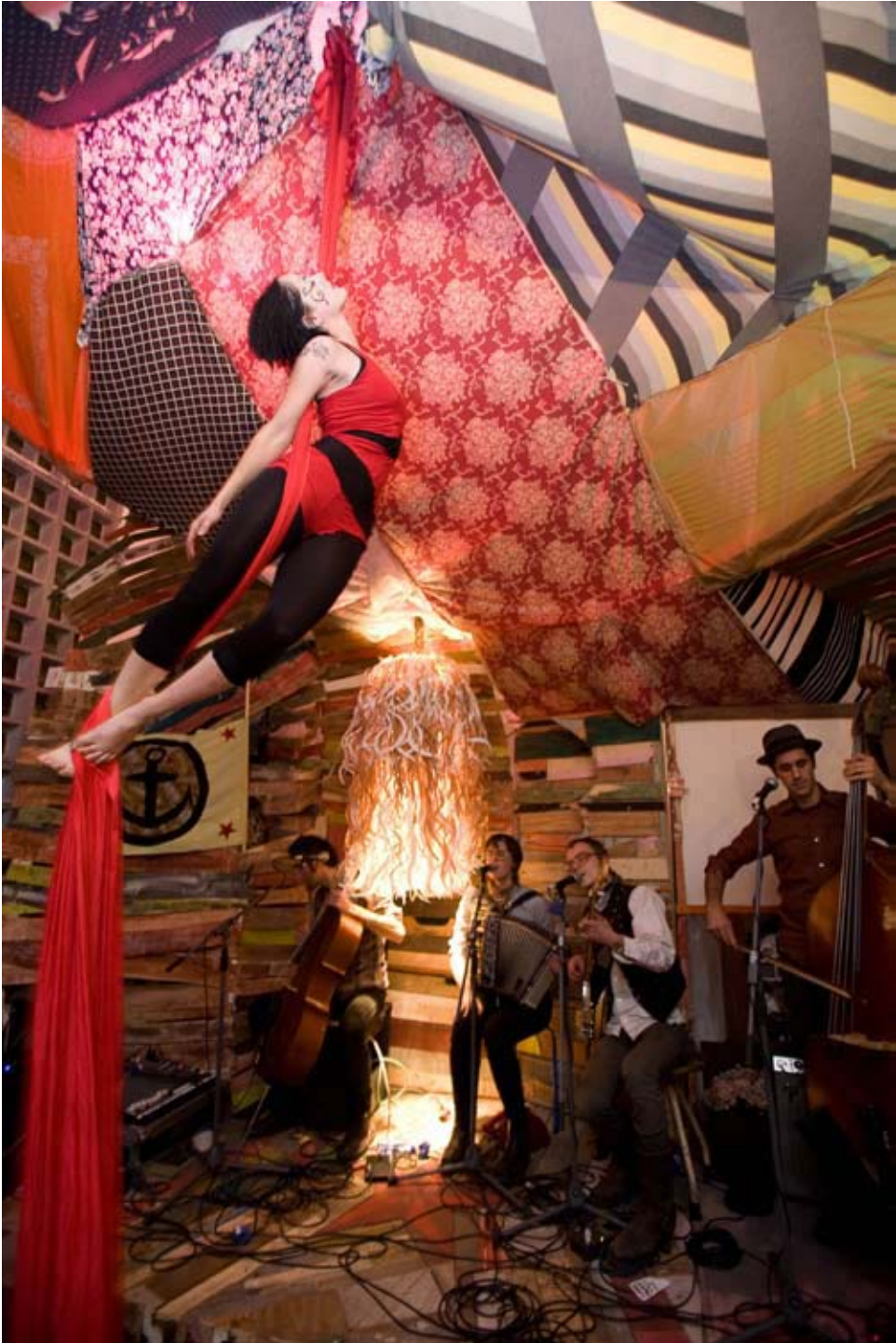
Members of Miss Rockaway Armada performing at the Van Abbemuseum as part of Hope Floats , 2008